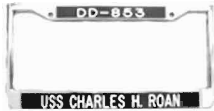
License Plate Holder with ships name USS Charles H. Roan DD-853 $20.00