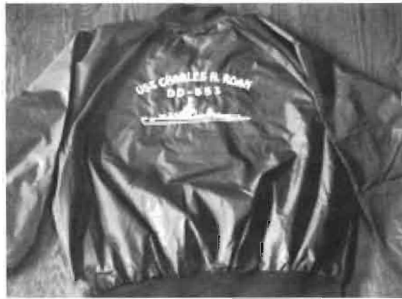
Wind Breaker Jacket Navy Blue Embroidered with ship silhouette and ships name on back in Gold lettering